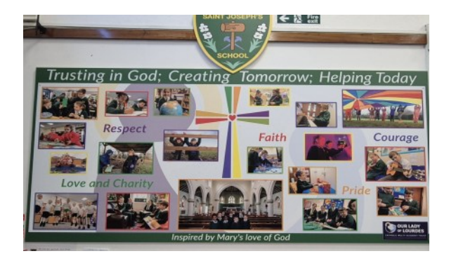
Roadshow visits - St Joseph's Catholic Primary School in Mansfield

In addition to the above, St Philip's team of faith practitioners delivered a Roadshow at Haven High Academy. This is what the teacher had to say: