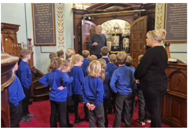
One of the three visits to places of worship by Burton-On-The-Wolds Primary School