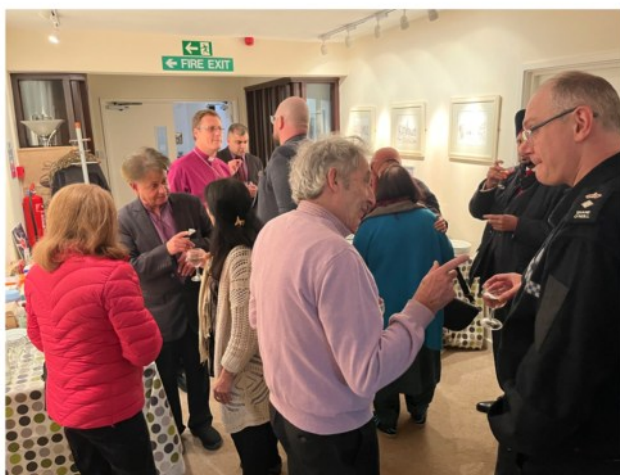
Bishop's Faith Leaders Forum