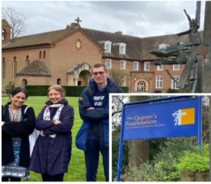
Teaching at the Queen's Foundation