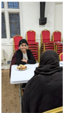
Grannies' Tales session at St Peter's Church, Highfields