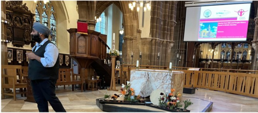
Talk on Sikh Christian connections