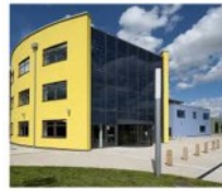
Community Cohesion Focus Groups at The City of Leicester, WQE & Gateway Colleges