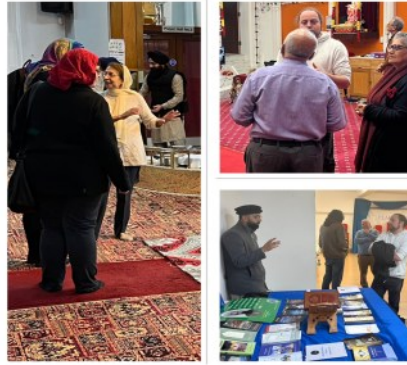
Place of Worship visits for Methodist Ministers