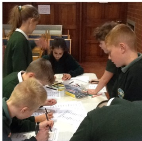
Braunston C.E. Primary School

The children (and adults!) had a fantastic time at the Mosque and the St Philip's Centre. They found it so interesting and the teachers all said that it was an amazing day ... we are so lucky to have the St Philip's Centre to arrange these valuable experiences for our children. (Braunston Primary School)