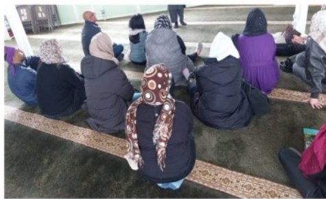
Training for NHS staff