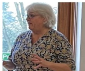
Near Neighbours International Women's Day event