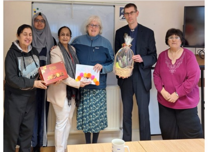
Near Neighbours Leadership Training