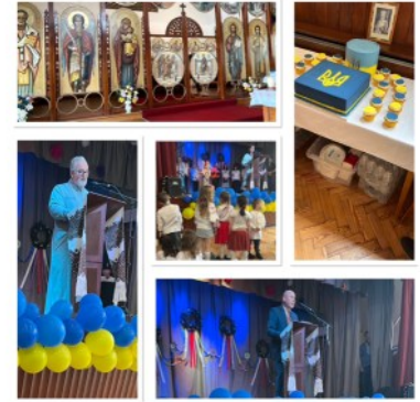
Ukrainian Catholic Church