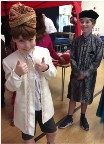
St John's C.E. Primary School