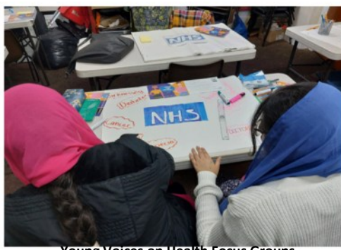
Young Voices on Health Focus Groups