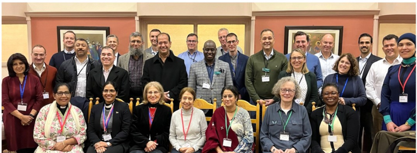
Royal College of Defence Studies visit