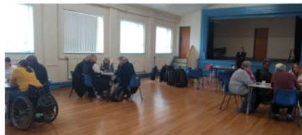
Training for Leicestershire County Council staff