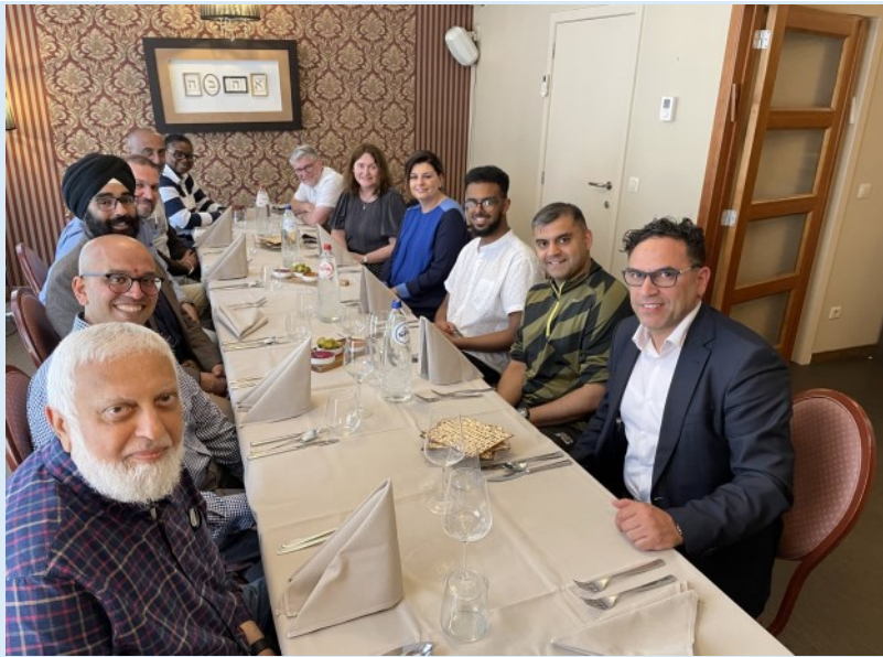
Meeting the hosts in Antwerp, Belgium for dinner to discuss the busy days ahead to share & learn about diversity in policing.