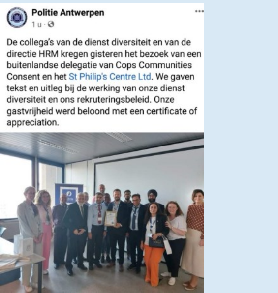
The Antwerp police were also tweeting about the visit.