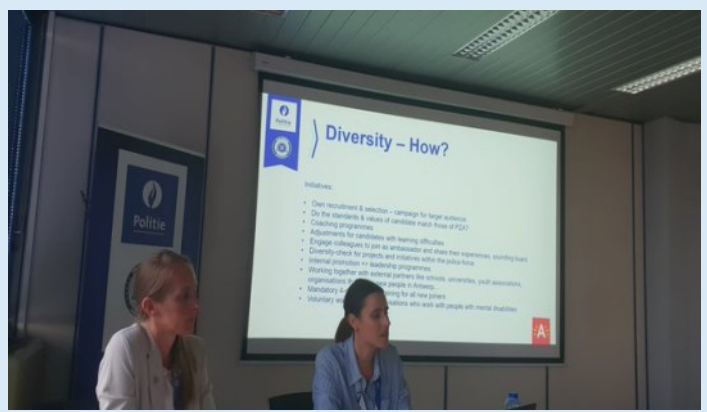
Doing comparative study, investigating police-community relations and the public perception of the police between Leicester and Antwerp, part of the CCC project.