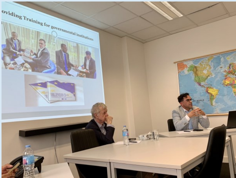
Excellent meeting and discussion with the Brussels International Centre exploring issues for policymakers on counter-extremism and community engagement.